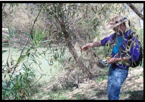
Barbed wire fence crossing

From Plazuela de La Estación, cross the tracks and remain on the blacktop road to the right (to Cieneguita) for about 3 miles/4.8 kilometers. Turn left at sign pointing to Guanajuato (Guanajuato Bridge). There is a small pull-off on the right before crossing the bridge that is suitable for one car. Alternatively, cross the bridge and take the first left into a large dirt lot.