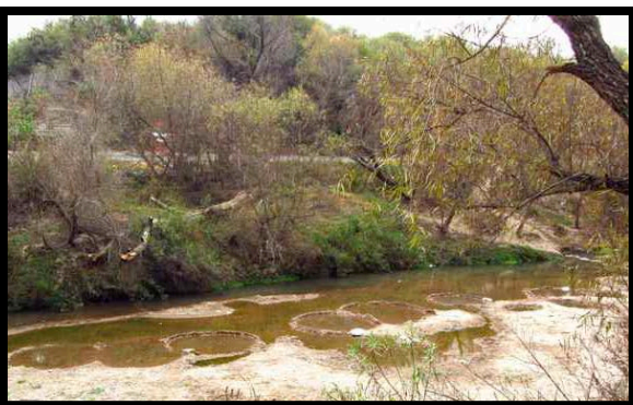
Warm pools used for washing near Xote

Waypoint 4: End of Section 3, and start of Section 4, at 3.42 miles/ 5.5 km. GPS coordinates: 20.98, -100.805. The section ends at the Casa de Aves Bridge. This location is 7.19 miles/ 11.57 km from the start of Section 1.