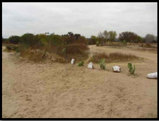
White painted rocks and nopales

right (low). A fence on the left side encroaches the trail, making it necessary to cross the river.